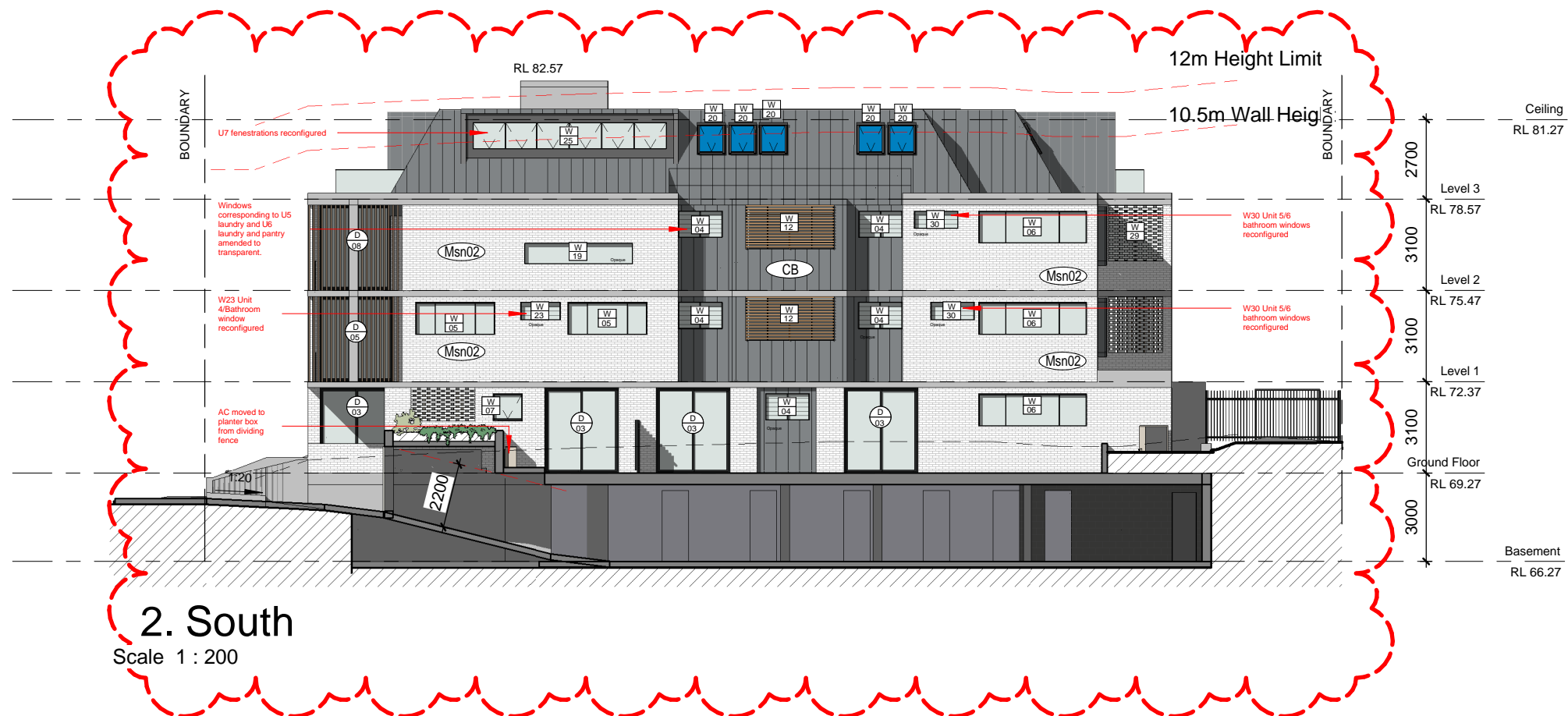
2. South Scale 1 : 200